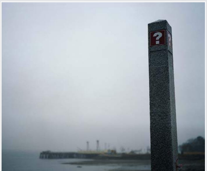
Plymouth, MA, 2007 archival inkjet print, 42" x 50"

Oscar Palacio is interested in photographing the seemingly invisible, the overlooked and the familiar. He is also interested in the human need to create boundaries and control nature in order to delineate property and privacy and to instill protection. This new series of photographs continues his investigation of public space in the United States by shifting emphasis from anonymous prosaic scenes of everyday life to popular historical sites, which have both an embedded meaning and assumed historical narrative. For the past year he has been photographing in and around historic sites where the dividing lines between nature and the constructed, and between public and private space, are apparent. What we as a society choose to memorialize, and how the representational roles of both architecture and photography shape and form experience, are among the many questions he addresses in his work.